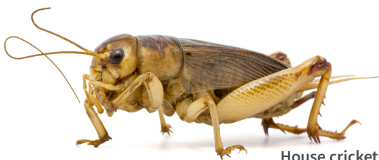
House crickets (Acheta domesticus)