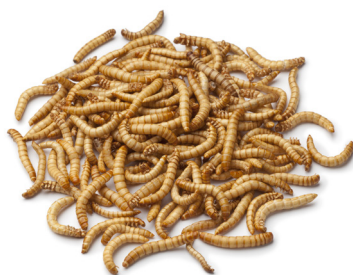
Yellow mealworms (Tenebrio molitor)