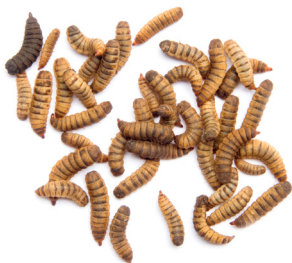
Black soldier fly (BSF larvae) (Hermetia illucens)

There are currently seven species of insects that are authorised in the EU for use in pet food 2 . The top three most prevalent species of farmed insects for use in pet foods are illustrated below.